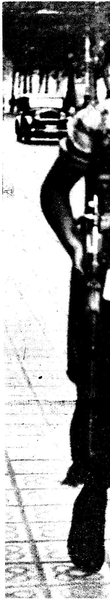
ANTI-FASCIST FIGHTER IN