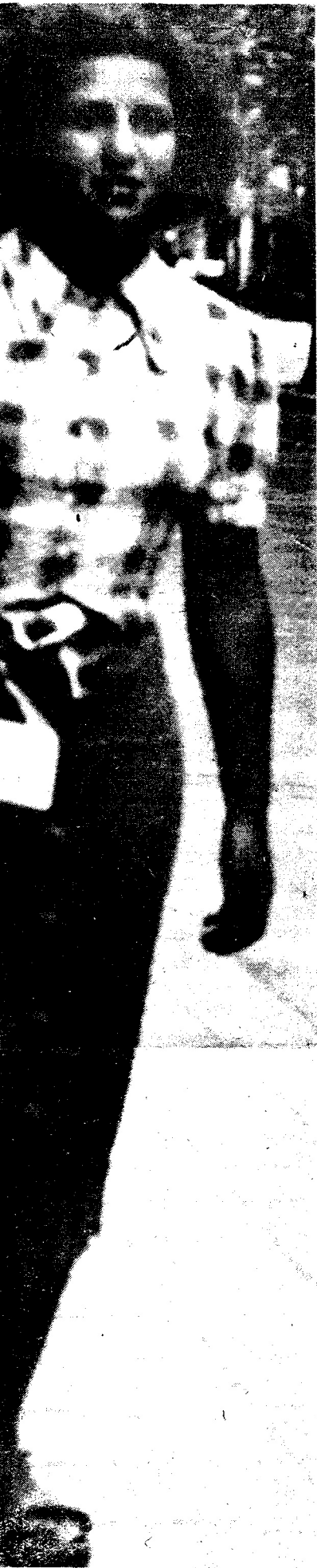
ONA DURING CIVIL WAR -- 1936

ope demonstrate that Spain has a meaning for European workers that goes beyond solidarity alone. The protests showed in fact that the European revolution is beginning and that the Spanish revolution will be the detonator of this revolution. The Spanish revolution will break the isolation of the Portuguese proletariat, it will impel the French working class on the path of the general strike to bring down Giscard, it will begin the revolutionary mobilization throughout Europe.